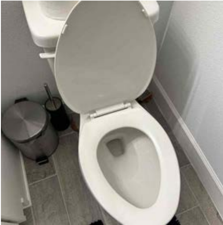
Loc: 28.6684, -81.5288

Interior / Flush all toilets, do they flush properly without leaks or continuing to run?