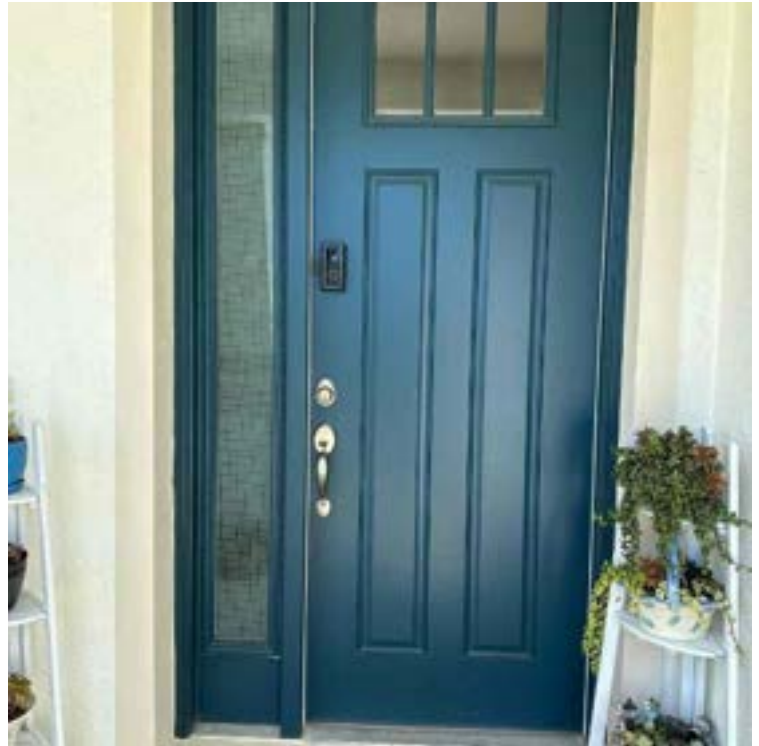
Loc: 28.6683, -81.5288

Exterior / Select where the lockbox is located. See example images below and check all exterior walls, utility meters, HVAC units, and hose bibs.