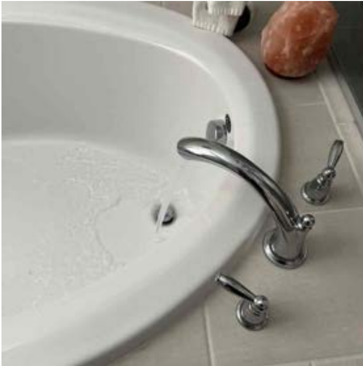
Loc: 28.6684, -81.5287

Interior / Test all tub faucets/shower heads, do they operate normally without leaks?