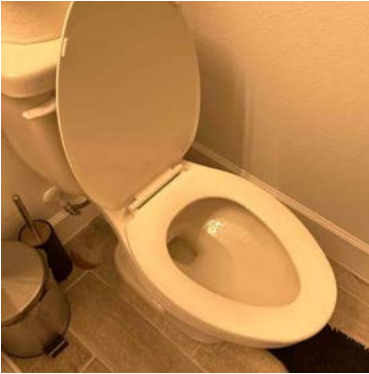
Loc: 28.6684, -81.5288

Interior / How many toilets are in the home?