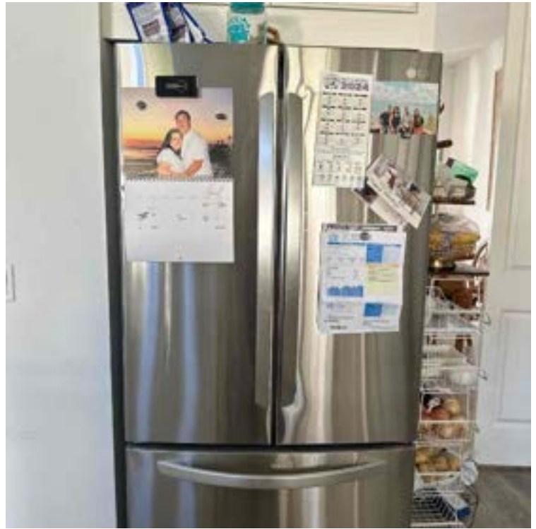
Loc: 28.6684, -81.5288

Interior / What Appliances are present at the property?