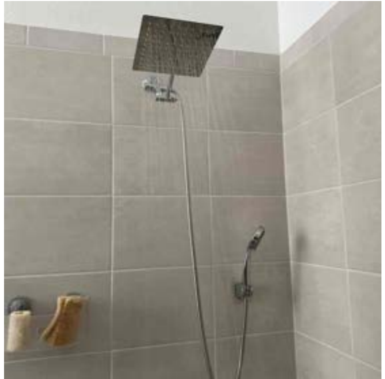
Loc: 28.6683, -81.5287

Interior / Test all tub faucets/shower heads, do they operate normally without leaks?