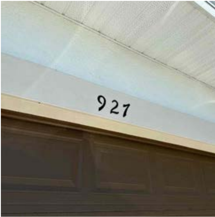
Loc: 28.6683, -81.5288

Exterior / Are house address numbers installed on the home?