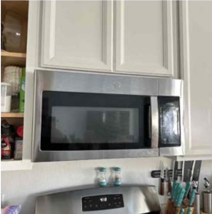
Loc: 28.6685, -81.5288

Interior / What Appliances are present at the property?