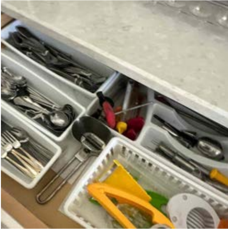
Loc: 28.6684, -81.5288

Interior / Check all kitchen drawers for an additional house key and/or garage door opener. Is there an additional house key and/or garage door opener in any of the kitchen drawers?