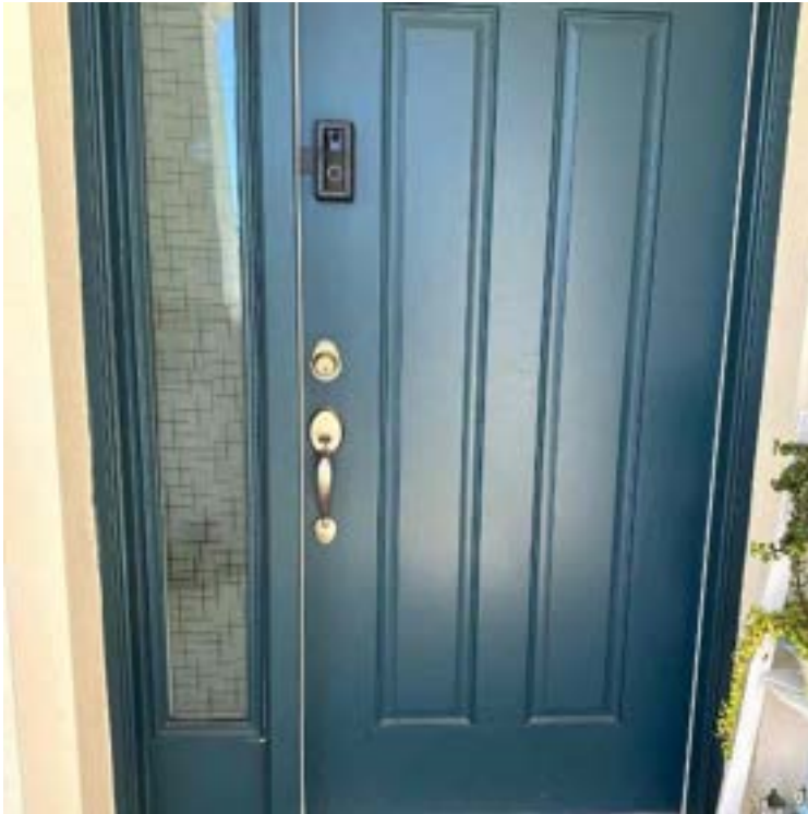
Loc: 28.6683, -81.5288

Exterior / Is the home properly secured and free from casual entry? (All doors and windows properly shut and locked.)