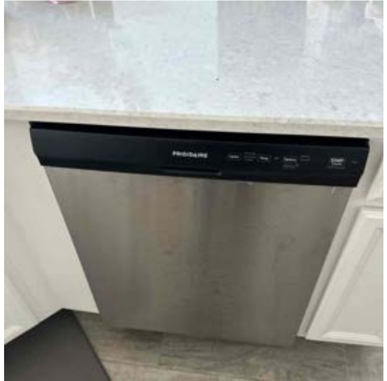
Loc: 28.6684, -81.5288

Interior / What Appliances are present at the property?