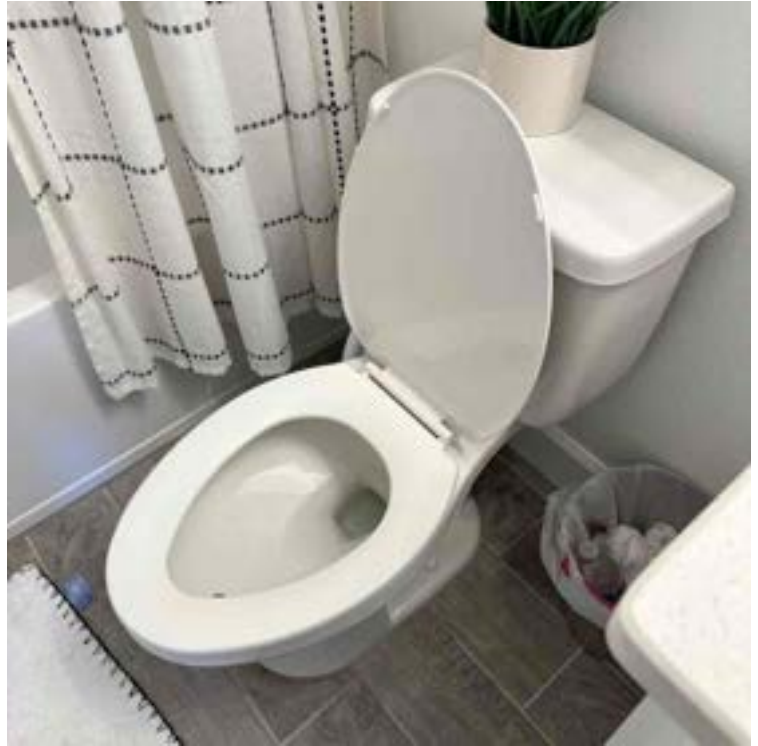
Loc: 28.6684, -81.5288

Interior / How many toilets are in the home?