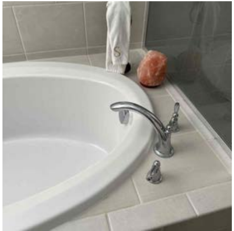
Loc: 28.6684, -81.5287

Interior / Test all tub faucets/shower heads, do they operate normally without leaks?