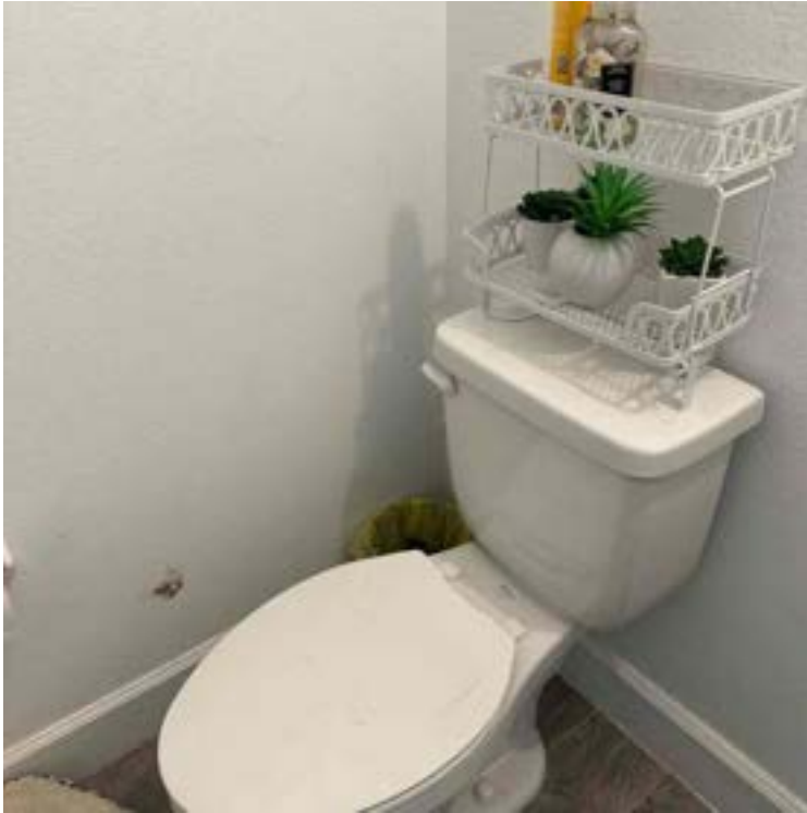
Loc: 28.6684, -81.5288

Interior / How many toilets are in the home?