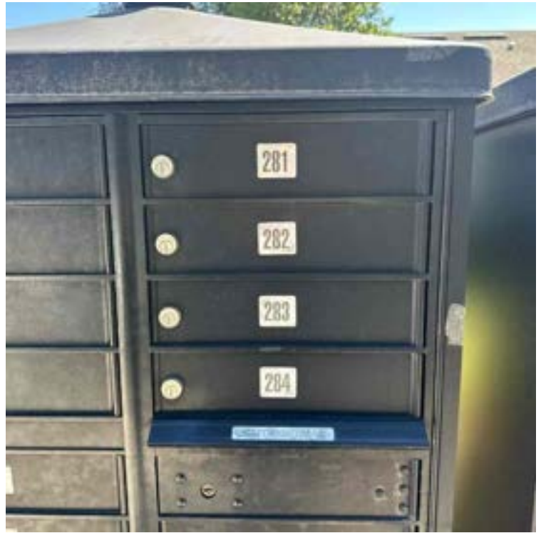
Loc: 28.6703, -81.5325

Exterior / Is the home properly secured and free from casual entry? (All doors and windows properly shut and locked.)