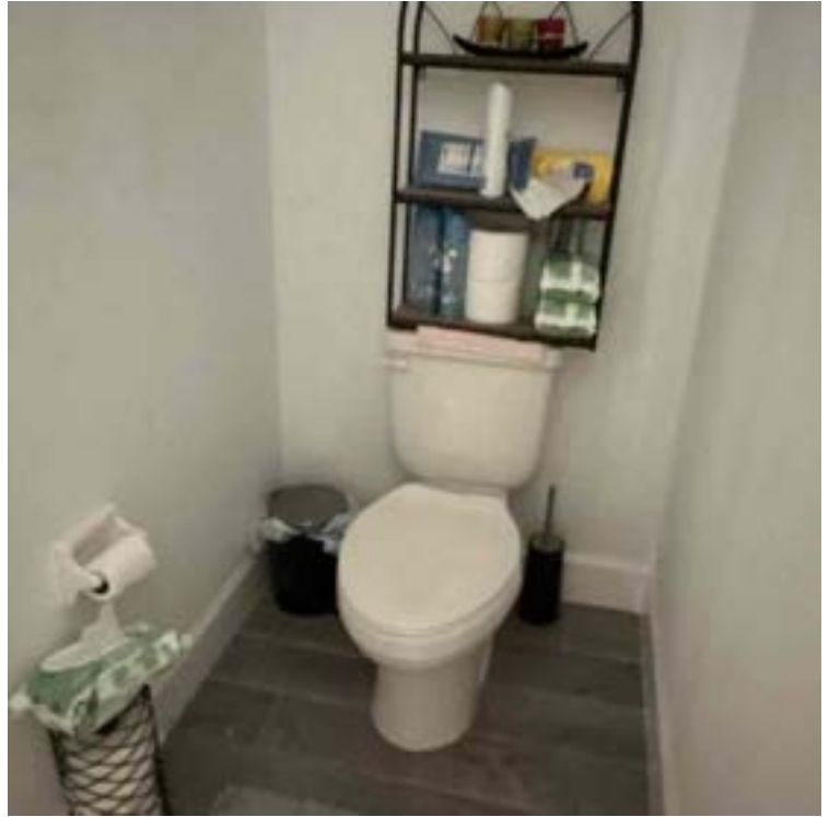
Loc: 28.6684, -81.5287

Interior / How many toilets are in the home?