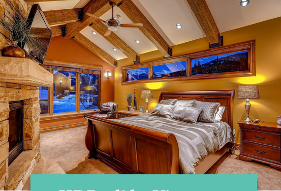
HDReal® by Virtuance